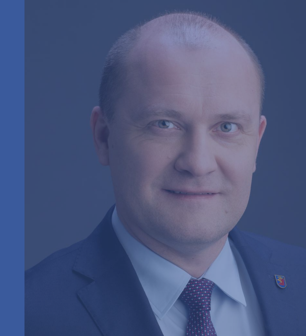
Piotr Krzystek Mayor of the City of Szczecin